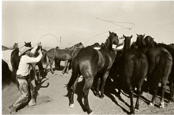
Bank Langmore, 6666 Ranch - Guthrie, Texas (1974)