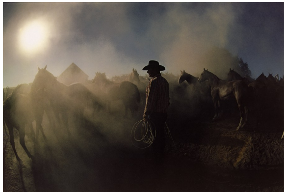
Bank Langmore, MC Ranch - Adel, Oregon (1974)