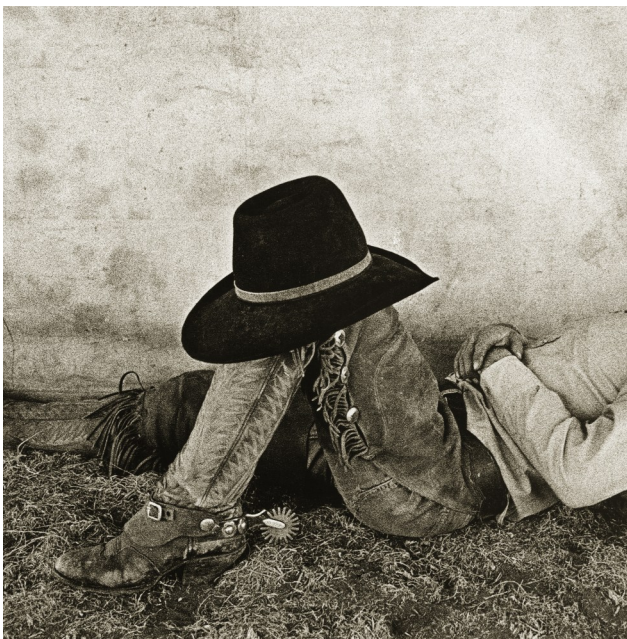
Bank Langmore, Bell Ranch - Tucumcari, New Mexico (1973)