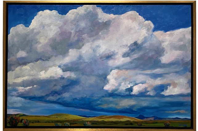
Solo Cloud , Caroline Korbell Carrington, Oil on Canvas

Have you ever looked up to the sky and noticed just how amazing clouds are? They can change colors, create beautiful formations, and you can play I-Spy while watching them! In Western Art, clouds are just as much a part of the landscape as the animals and plants are. Many artists are known for the impressive way that they portray clouds in their art. Using inspiration from the painting Solo Cloud , create your own landscape featuring a big, fluffy cloud: